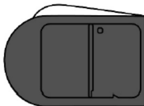
Figure 1 folding the link device.